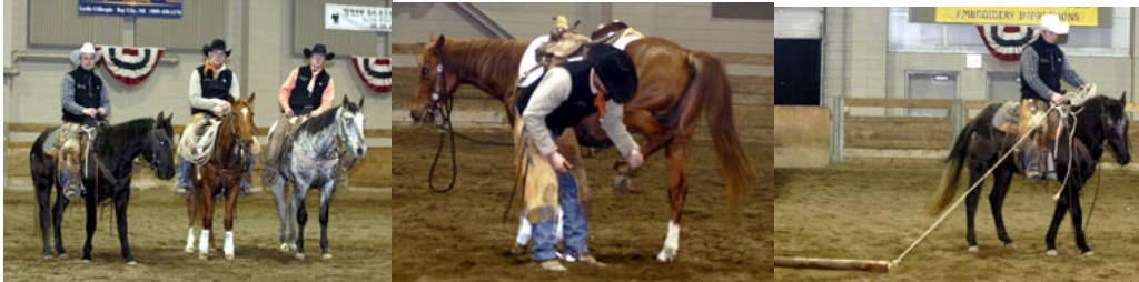
Photos from 2009 Colt Challenge

On Sunday, these ten AQHA two year olds will be offered for sale at public auction, right here in the Main Arena at the MHC Horse Expo. Information on this exceptional group of quality AQHA two year olds is available on the Cross Winds Ranch website, and in sale catalogs that will be available at the MHC Horse Expo.